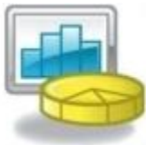
Chart: Nutrition Facts for Raw Rambutan Pulp

Nutrition facts for rambutan pulp ( Nephelium lappaceum ) are provided per 100 grams in the chart below. The nutrition facts provided below include both the absolute amount and the percent daily value for each nutrient.